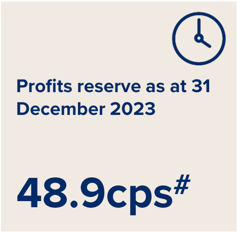
Fully franked dividends since inception